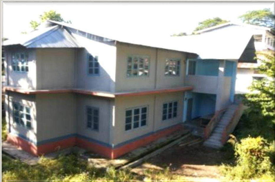
T – IV - 2 UNIT