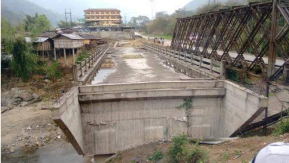
RCC BRIDGE (40 MTR. SPAN) AT CH 1.850 KM