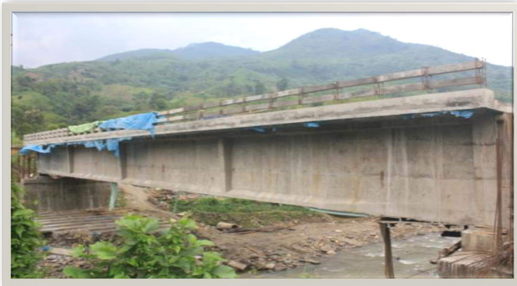
RCC BRIDGE 40 MTR SPAN OVER TISSING RIVER.