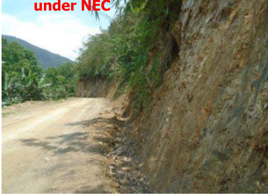
Widening Hard Rock 36.800 Km