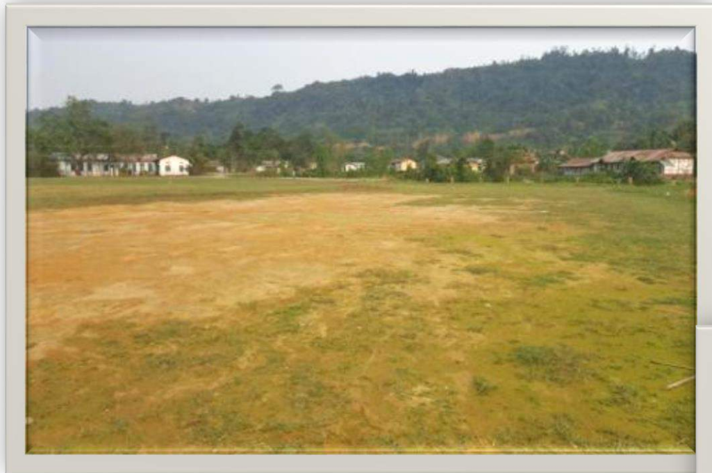
PLAY GROUND LEVELLING