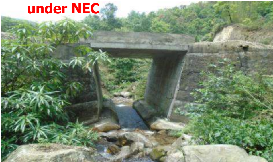
RCC Slab Culvert(3m Span)