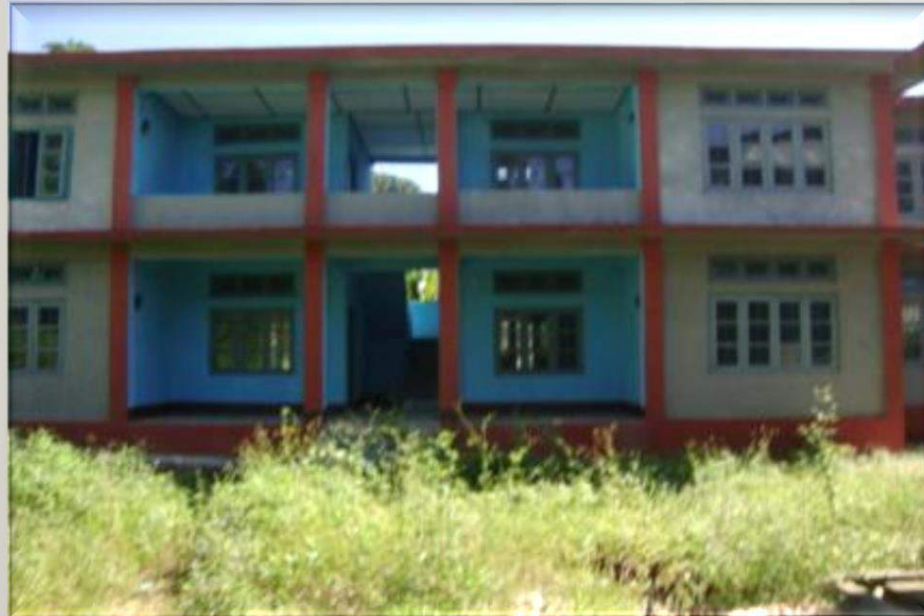
T - III – 4 UNIT