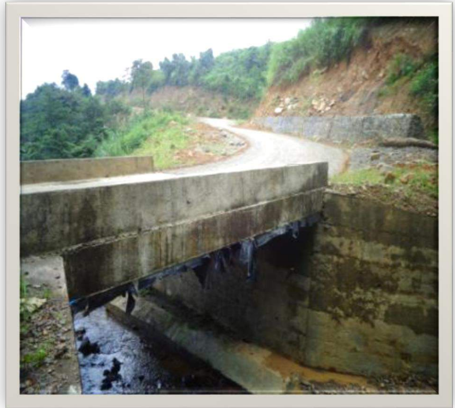
CH:- 4.021 KM (6 MTR SPAN)