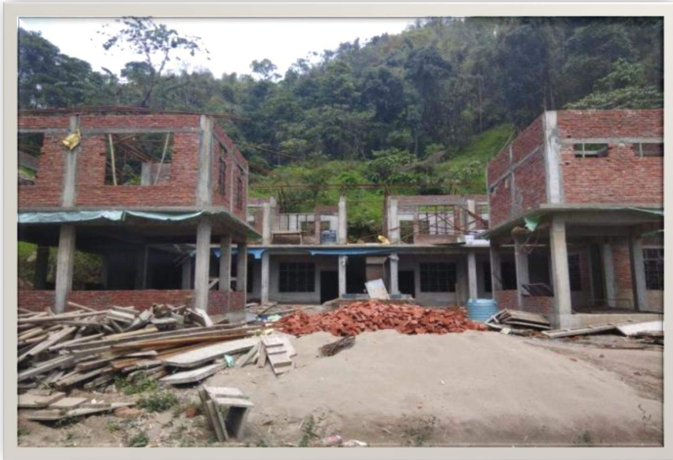
GIRLS HOSTEL IN PROGRESS