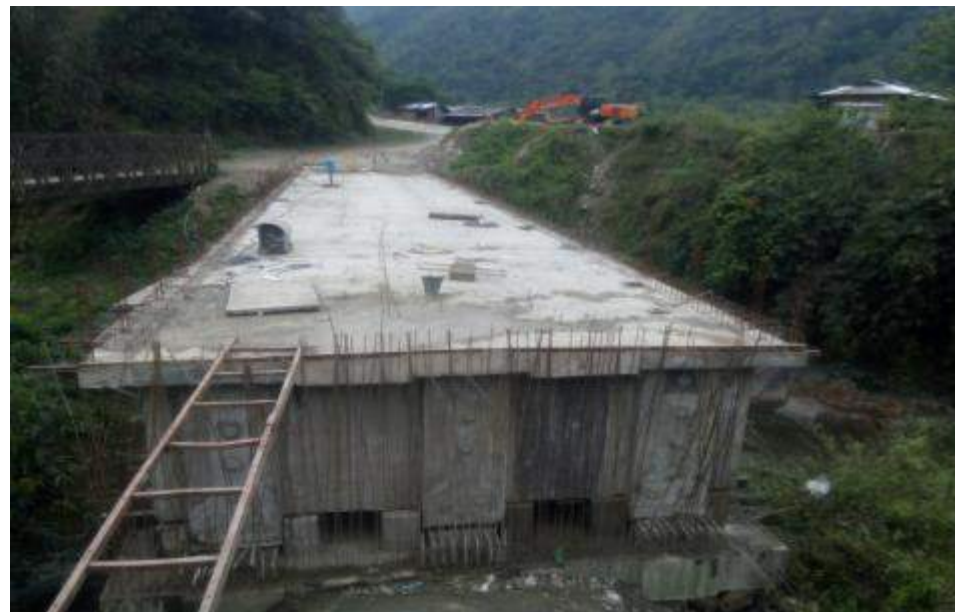
RCC Bridge (40 Mtr. Span) 18.100 Km