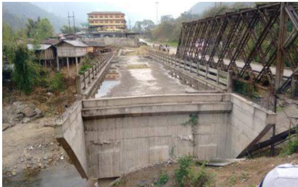
RCC Bridge (40 Mtr. Span) 1.850 Km