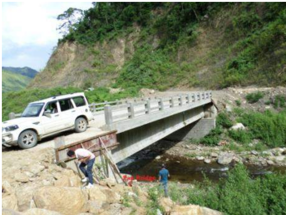
RCC Bridge over Pha