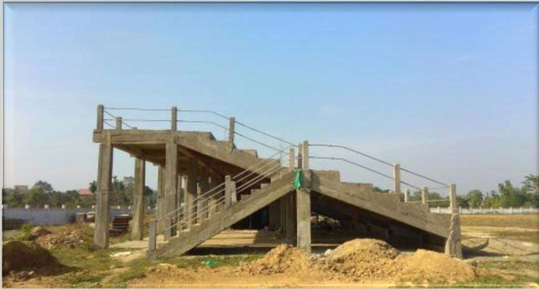
PUBLIC GALLERY NO.-2, SIDE VIEW