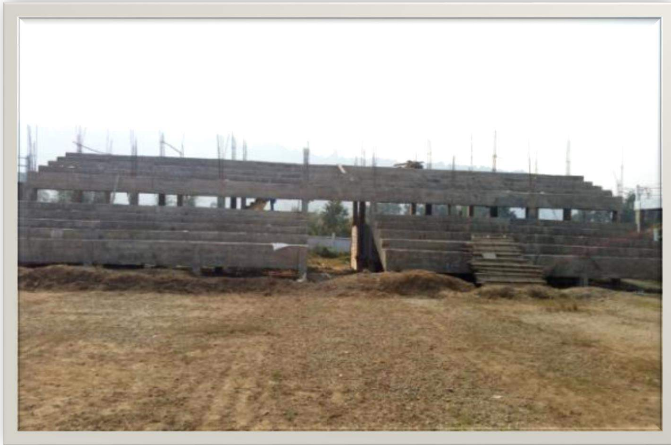
FRONT VIEW - (VIP GALLERY)