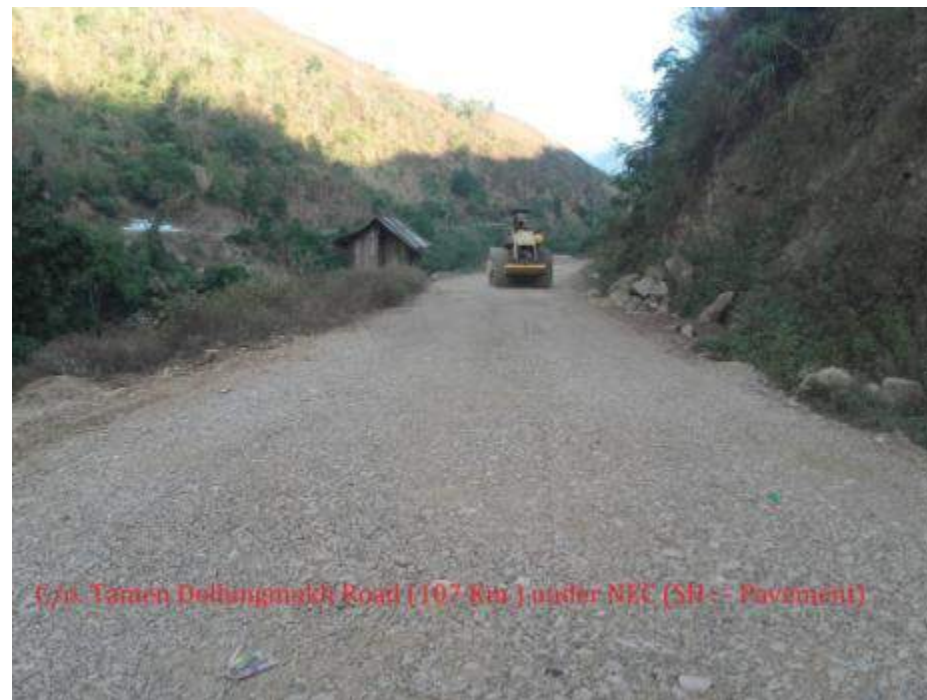
Pavement works in progress