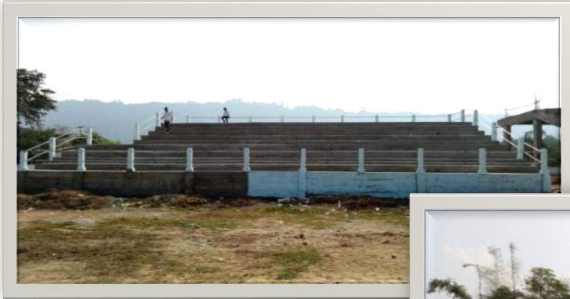
FRONT VIEW - (PUBLIC GALLERY NO. 1)