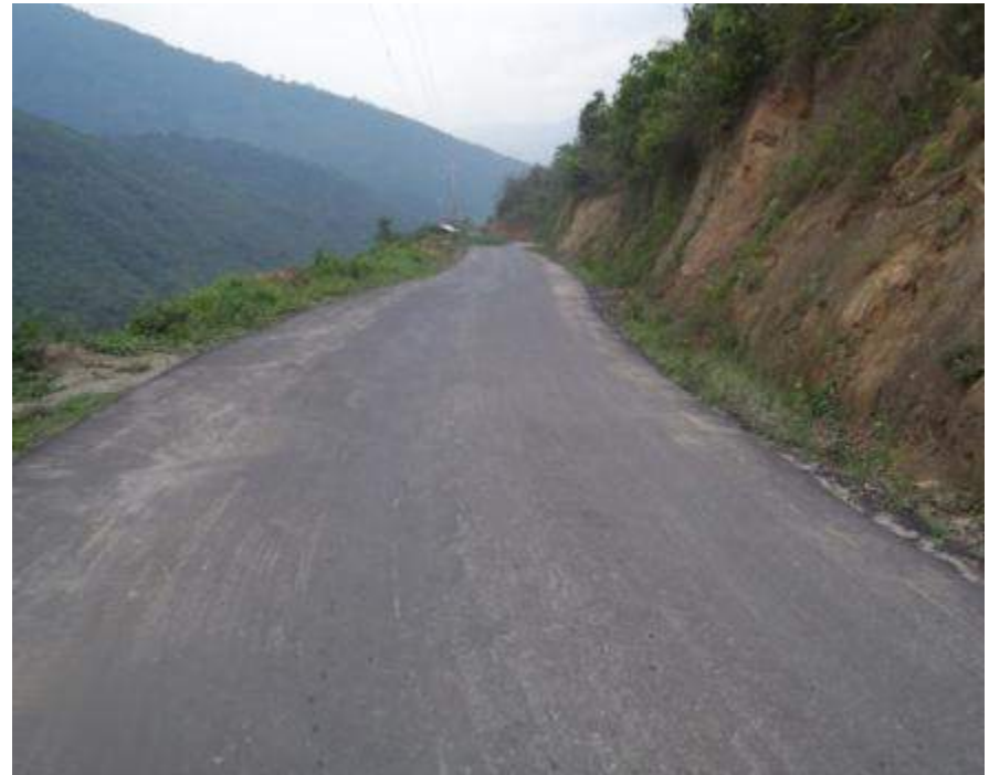
BLACK TOPPED SURFACE