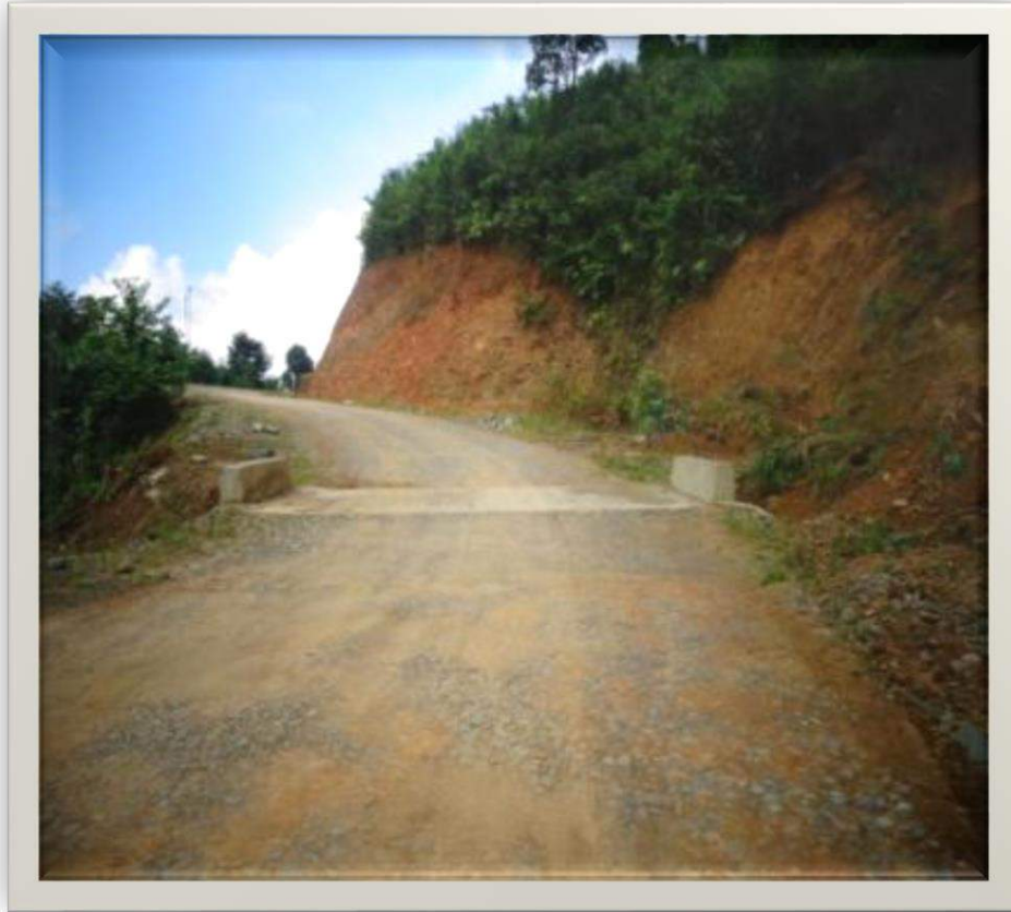
CH:- 0.200 KM (6 MTR SPAN)