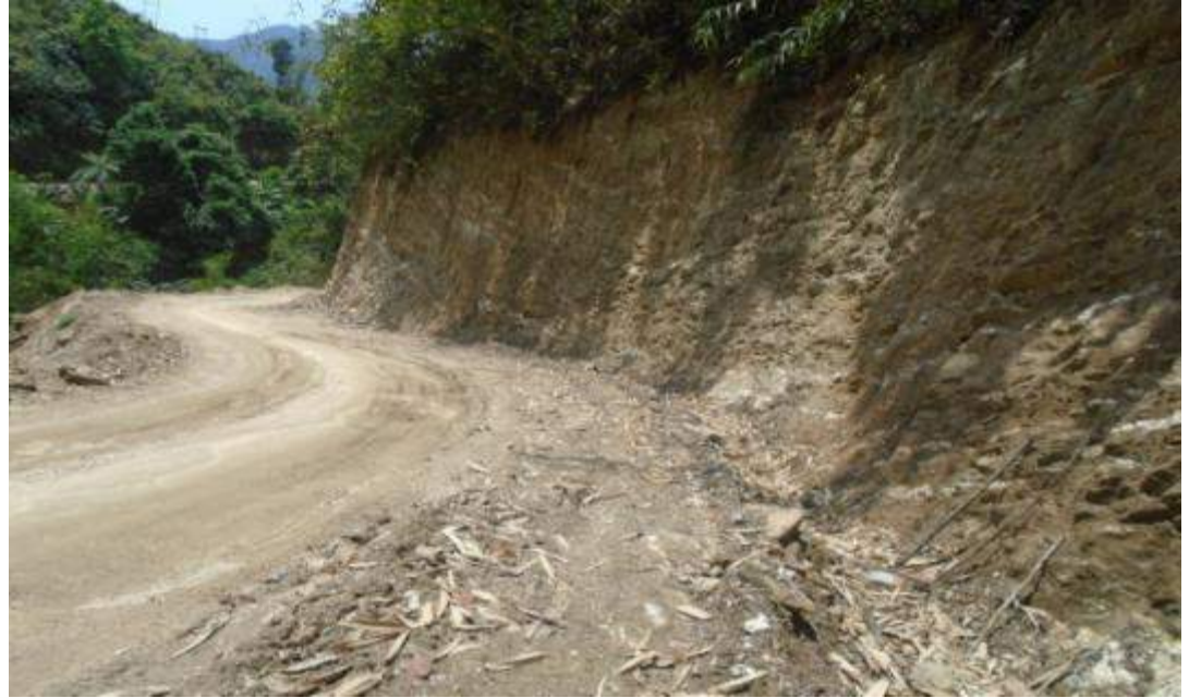
Widening Hard Rock 38.205 Km